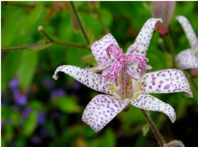
Garden Orchid

A special thanks to David and Kathy Hughes for hosting our September kick off meeting. There were not too many of you there and you missed some great food along with BBQ'd salmon and ribs. The